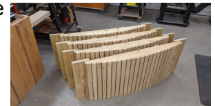
Turtle Docks for Sale